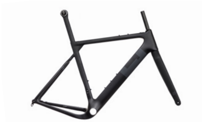
EXPLORO LTD STEALTH